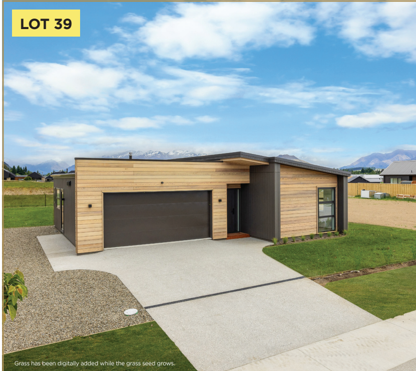
Grass has been digitally added while the grass seed grows.